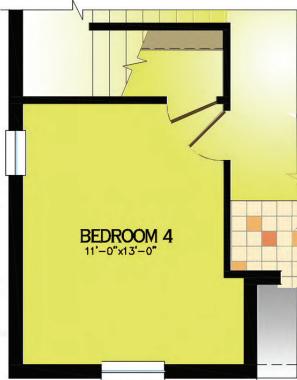
Optional 4th Bedroom in lieu of Den