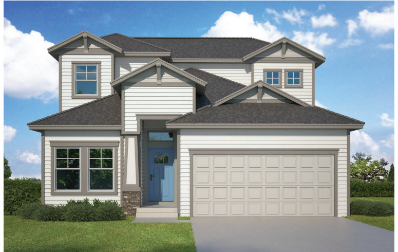
ELEVATION B — TWO STORY