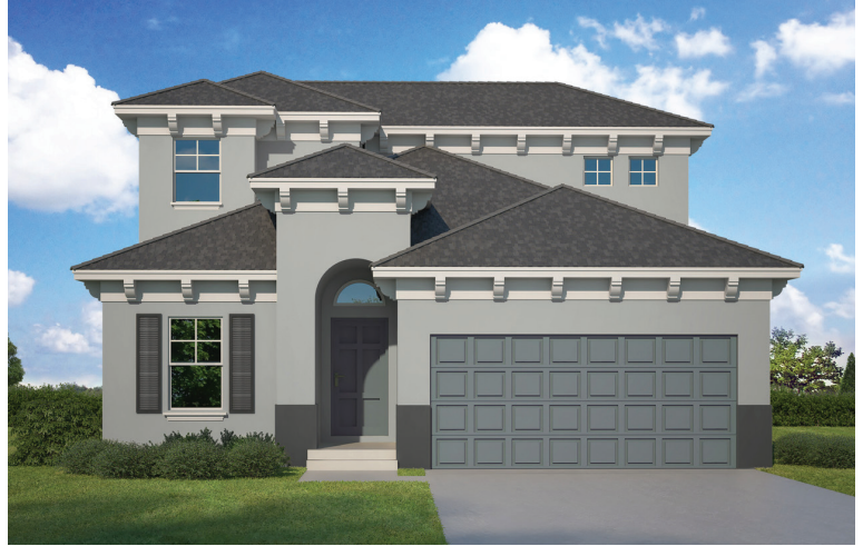
ELEVATION A — TWO STORY