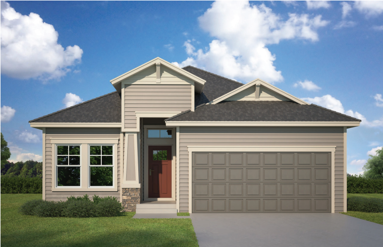
ELEVATION B — SINGLE STORY