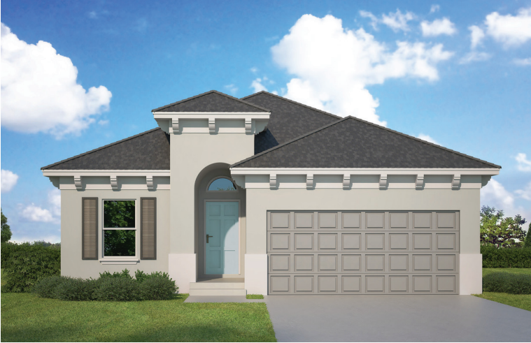
ELEVATION A — SINGLE STORY