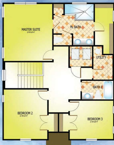
UPPER FLOOR PLAN "A"