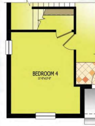
OPT. BEDROOM 4