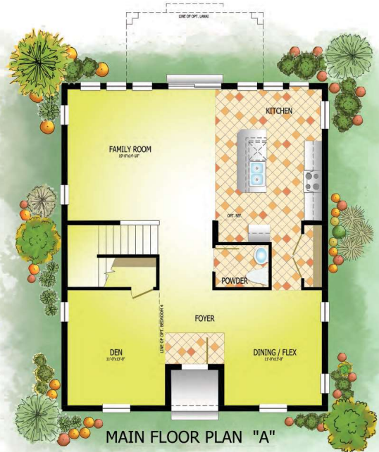
MAIN FLOOR PLAN "A"